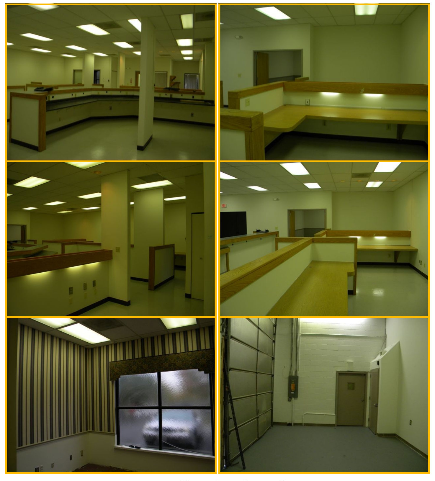
Interior pictures office finish and receiving area 11561 and 11563 Edmonston Road

The information contained herein has been given to us by the owner of the property or obtained from sources we deem reliable. No warranty or representation, express or implied, is made as to the accuracy of the information contained herein, and same is submitted subject to errors, omissions, change of price, sale or other conditions, withdrawal without notice and to any special listing conditions imposed by our principals